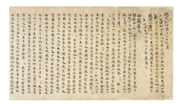
Figure 2: Youlan notation.

At the beginning of the 20th century, the pipa notations were discovered in western China in the Dunhuang Cave, which were in use before the 10th century AD. The original scores are preserved in Paris of National Library in France (BNF).