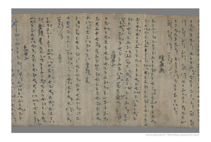
Figure 2: Dunhuang Pipa Notation preserved in BnF.

At the beginning of the 20th century, the pipa notations were discovered in western China in the Dunhuang Cave, which were in use before the 10th century AD. The original scores are preserved in Paris of National Library in France (BNF).