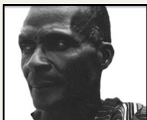
Dr. Ephraim Amu (1899-1995)