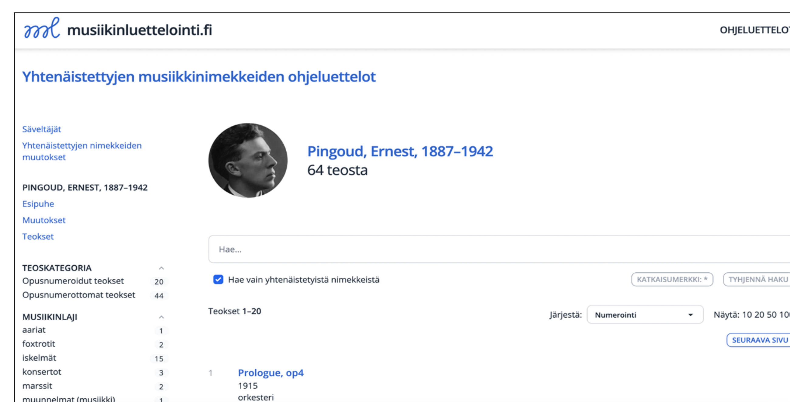
Index page for the uniform titles of the works of Ernest Pingoud.

The uniform title data in the database is mirrored in real time to an ElasticSearch index. The index is searchable via a custom search engine web application. The search engine 6 currently contains the uniform titles for the works of the Finnish composers Joonas Kokkonen (1921–1996) and Ernest Pingoud (1887–1942). Work is being carried out to include more composers in the database in the future. The goal is to include all 71 composers for whom catalogues of uniform titles currently exist in PDF format. All uniform title data published on the search engine is dedicated to the public domain under the Creative Commons CC0 licence.